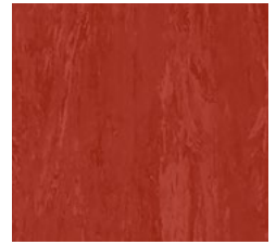
Ruby 3840 w/r 2560 NCS S 3060-Y80R LRV 14