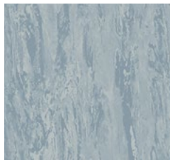
Blue Nickel 3730 w/r 5350 NCS S 3010-R90B LRV 39