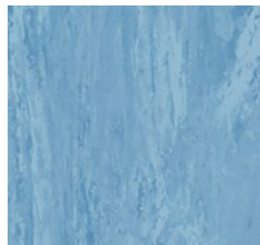
Crystal Blue 3740 w/r 3740 NCS S 2030-R90B LRV 38 ■