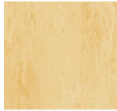
Opal 3920 w/r 2670 NCS S 1020-Y10R LRV 60