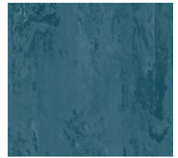
Dark Sapphire 3820 w/r 2530 NCS S 5020-B30G LRV 18