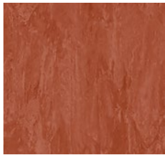
Ironstone 3850 w/r 3850 NCS S 4040-Y70R LRV 18