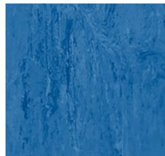
Tanzanite Blue 3750 w/r 3750 NCS S 4040-R90B LRV 19