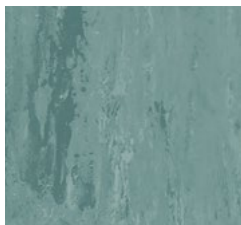
Turquoise 3810 w/r 2610 NCS S 4010-B70G LRV 31