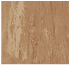
Sablee Beige 3900 w/r 2510 NCS S 4020-Y30R LRV 29