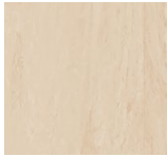
Carnelian Beige 3890 w/r 5330 NCS S 1510-Y30R LRV 61 ■ +