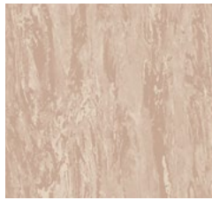
Rose Quartz 3870 w/r 3870 NCS S 2005-Y50R LRV 56