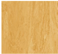
Citrine 3930 w/r 2660 NCS S 2030-Y20R LRV 46