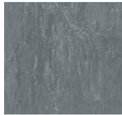
Flint 3720 w/r 3720 NCS S 5502-B LRV 25 ■ ■ +