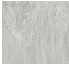
Pumice 3700 w/r 2650 NCS S 2000-N LRV 54 ■ ■ +