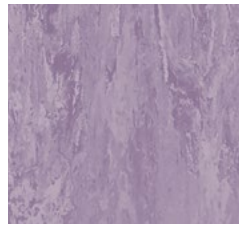
Amethyst 3780 w/r 3780 NCS S 3020-R50B LRV 36