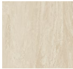
Porcelain 3880 w/r 3880 NCS S 1505-Y30R LRV 58 ■ +