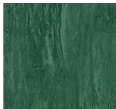
Jade 3830 w/r 2520 NCS S 6020-G LRV 14

w/r - Weld Rod LRV - Light Reflectance Value NCS - Natural Colour System ■ Sheet: 1.5mm - 2m x 27.5m ■ Tile: 2.0mm - 300mm x 300mm + Tile: 2.0mm - 608mm x 608mm