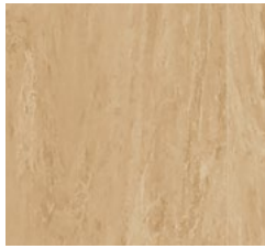
Dolomite 3910 w/r 2500 NCS S 3020-Y20R LRV 41 ■ +