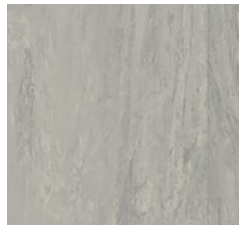
Fossil 3710 w/r 3710 NCS S 3000-N LRV 41 ■ ■ +