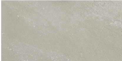
Balmoral Grey Slate 4534 LRV 40