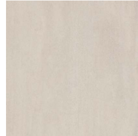
Silvered Concrete 4527 LRV 60