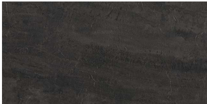
Welsh Raven Slate 4535 LRV 7