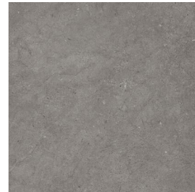
Refined Concrete 4528 LRV 22