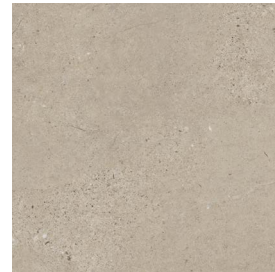
Fossil Limestone 4537 LRV 40