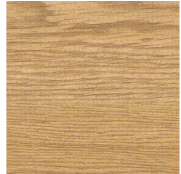
Classic Oak 3107 w/r 3330 plank w/l: 166 x 1500mm LRV 29