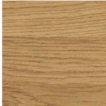
Rustic Oak 3337 w/r 3330 plank w/l: 83 x 333/666mm LRV 26