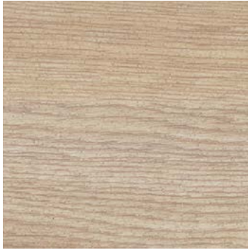
Oiled Oak 3374 w/r 3374 plank w/l: 166 x 1500mm LRV 37