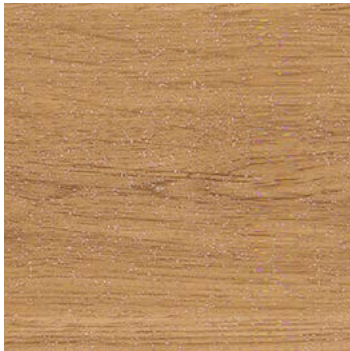
European Oak 3347 w/r 3340 plank w/l: 100 x 1000mm LRV 23