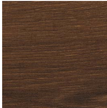
Aged Oak 3373 w/r 9824 plank w/l: 200 x 1500mm LRV 9