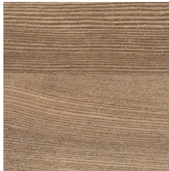
Tropical Pine 3376 w/r 9822 plank w/l: 166 x 1500mm LRV 22