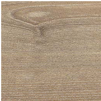
Roasted Limed Ash 3375 w/r 9831 plank w/l: 166 x 1500mm LRV 30