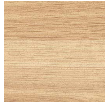
American Oak 3387 w/r 3380 plank w/l: 100 x 1000mm LRV 37