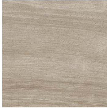
Sun Bleached Oak 3372 w/r 3372 plank w/l: 200 x 1500mm LRV 31