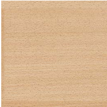
Warm Beech 3297 w/r 3290 plank w/l: 100 x 500mm LRV 35