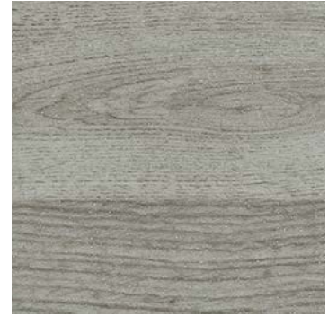
Silver Oak 3357 w/r 3237 plank w/l: 83 x 333/666mm LRV 23